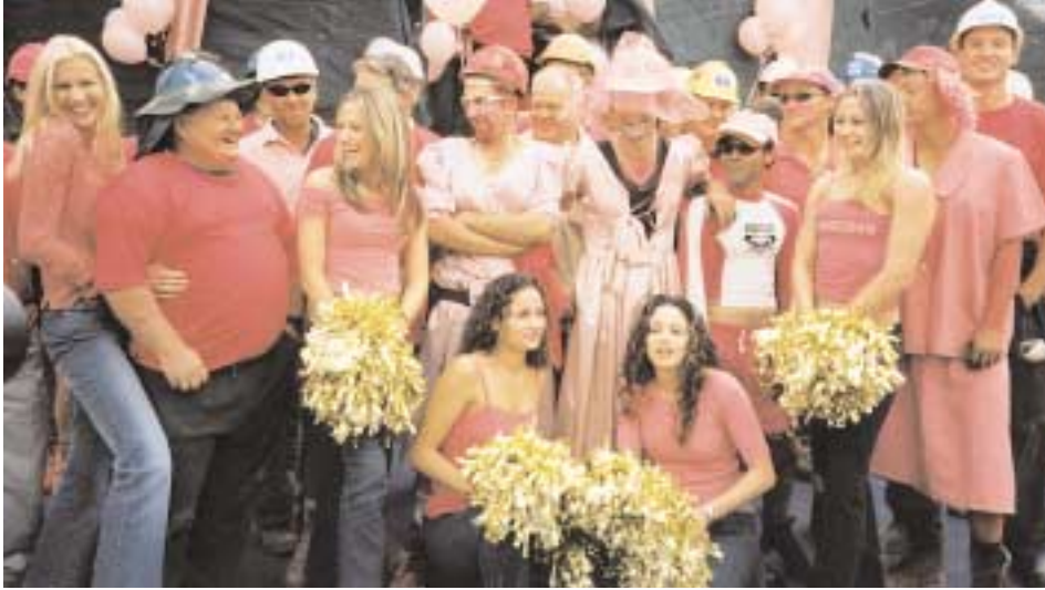
The Broncos' Cheerleaders with site crew.

HUTCHIES' crew on Leyshon's Regatta Riverside building site were recently, literally, in the pink.