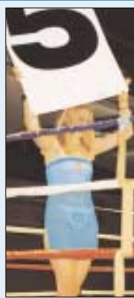
RIGHT: Fight hostess with traditional Hutchies g-string.